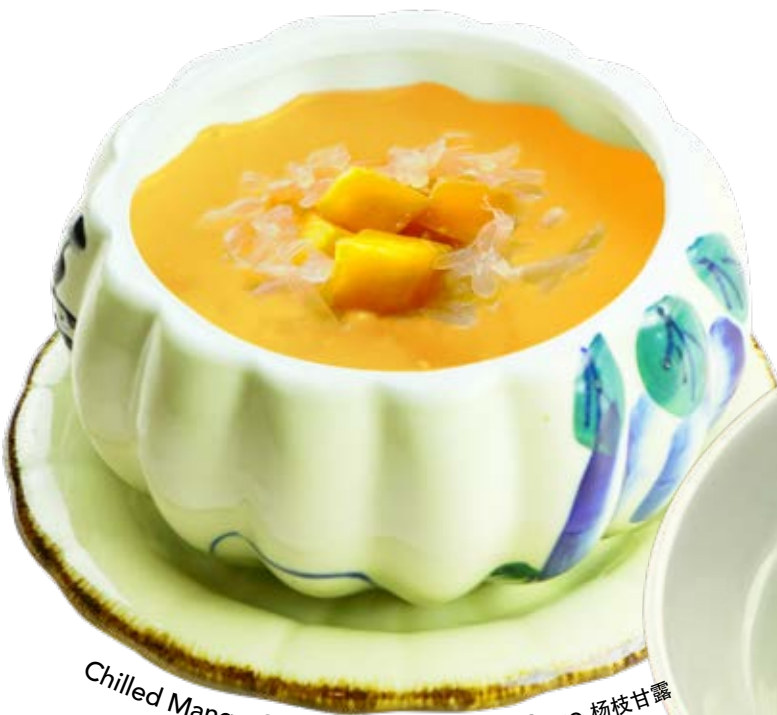
Chilled Mango Cream with Pomelo & Sago 杨枝甘露