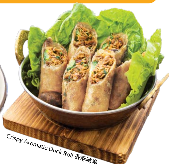
Crispy Aromatic Duck Roll 香酥鸭卷