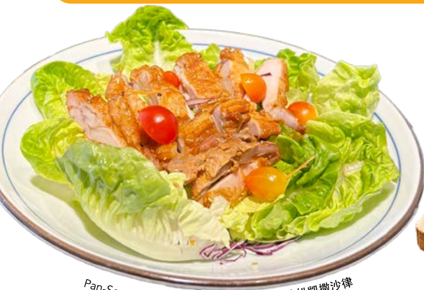
Pan-Seared Chicken Caesar Salad 香煎鸡扒凯撒沙律