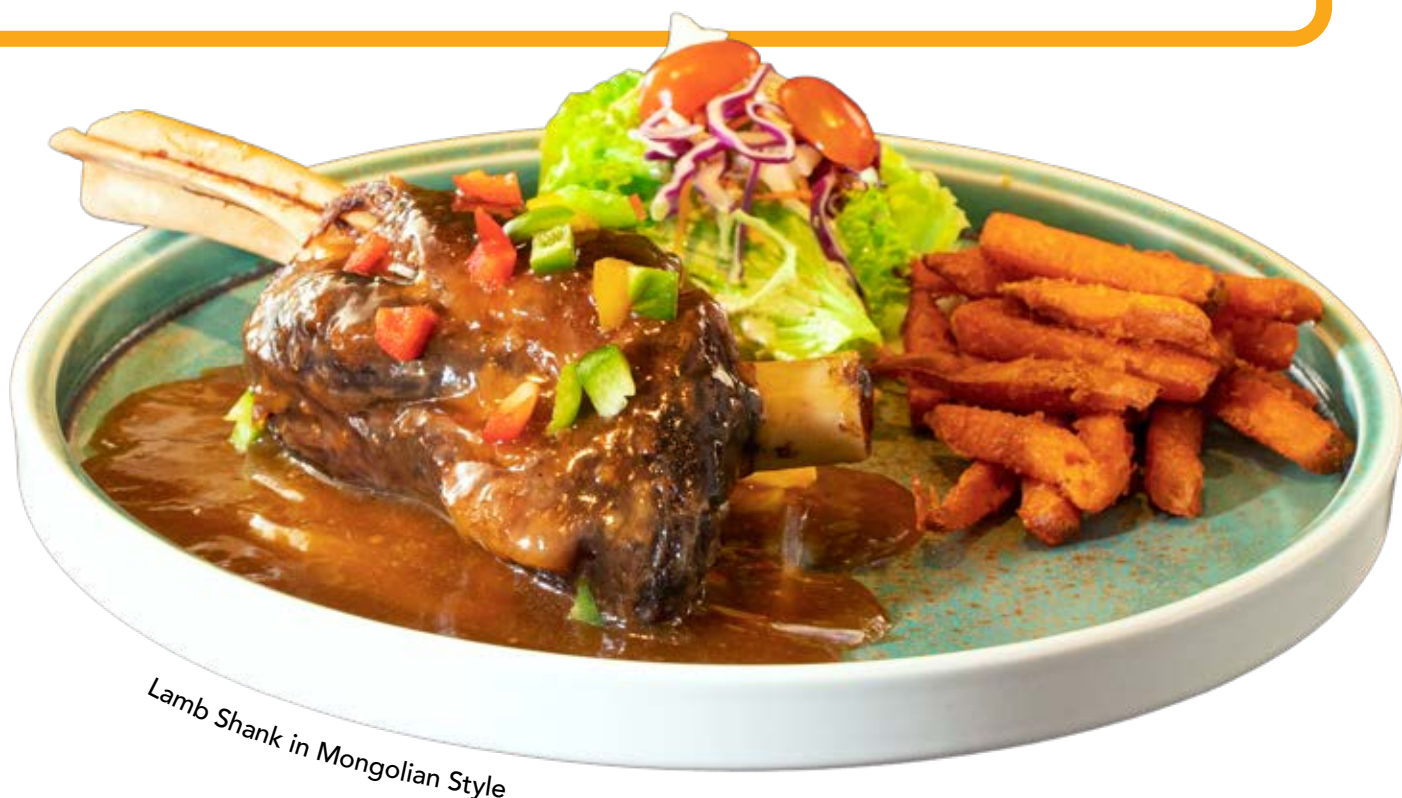
Lamb Shank in Mongolian Style