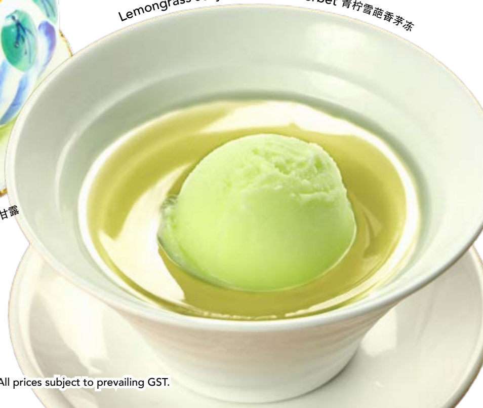
Lemongrass Jelly with Lime Sherbet 青柠雪葩香茅冻