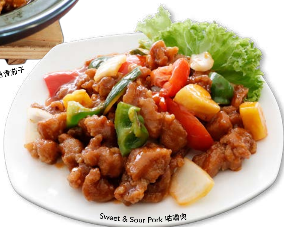
Sweet & Sour Pork 咕嚕肉