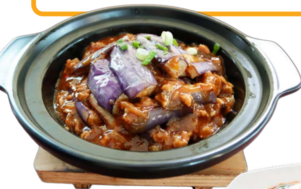
Braised Eggplant in Yu Xiang Style 鱼香茄子