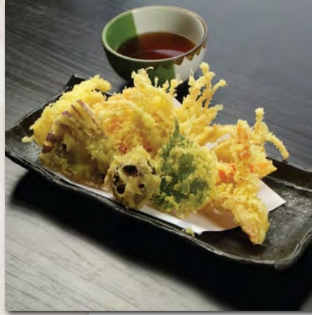
野菜天ぷら Yasai Tempura $16.80 Deep Fried Assorted Vegetables with Light Batter