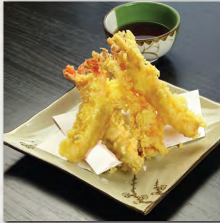
海老天ぷら Ebi Tempura $19.80 Deep Fried Prawn with Light Batter