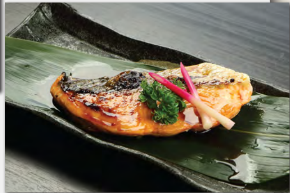
鮭の照り焼き Shake Teriyaki $16.80 Grilled Salmon Fillet with Teriyaki Sauce