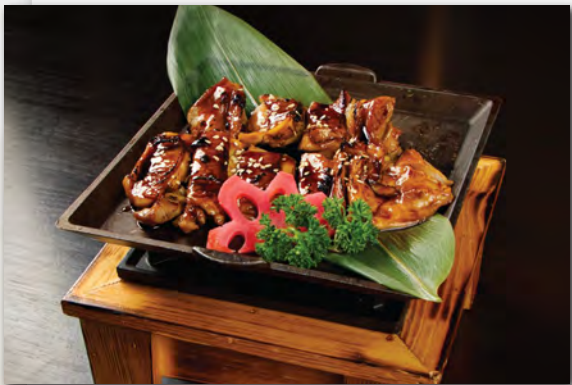
鳥照り焼き Tori Teriyaki $11.80 Fried Chicken Fillet with Teriyaki Sauce