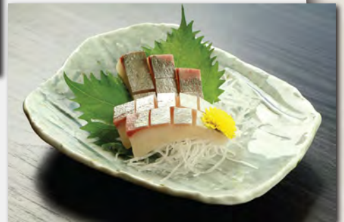
しまあじ刺身 Shimaaji Sashimi $20.80 Sliced Raw Striped Jack