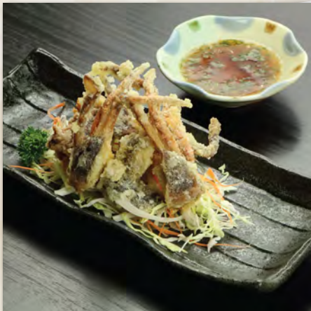
ワタリガニ の唐揚げ Soft Shell Crab Karaage $10.80 Deep Fried Soft Shell Crab