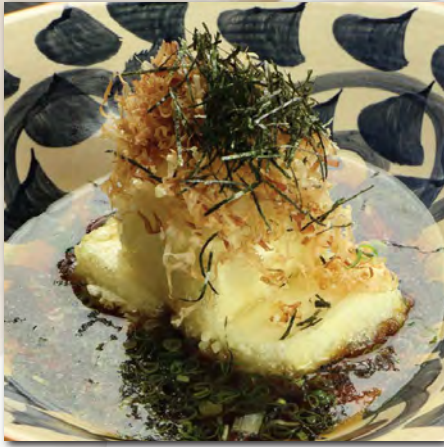
揚げ出し豆腐 Agedashi Tofu $6.80 Deep Fried Tofu