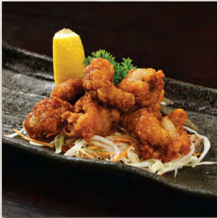
鶏の唐揚げ Tori Karaage $10.80 Deep Fried Chicken