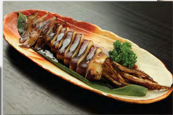
スルメイカの姿焼き Surumeika no Sugatayaki $20.80 Grilled Whole Arrowhead Squid