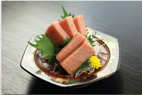
トロ刺身 Toro Sashimi $68.80 Sliced Raw Tuna Belly