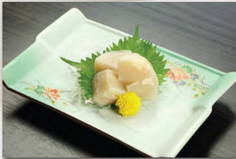
ホタテ貝 刺身 Hotategai Sashimi $13.80 Raw Scallop