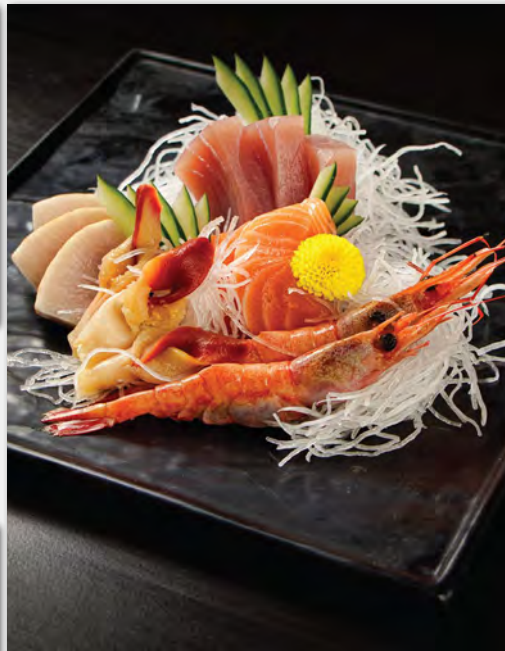
刺身 花 Sashimi Hana $38.80 Premium Assorted Sliced Raw Fish and Seafood