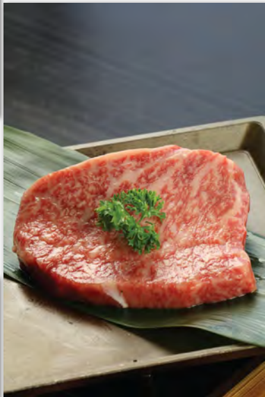
和牛焼き Wagyu Yaki $80.80/100g Grilled Wagyu Beef