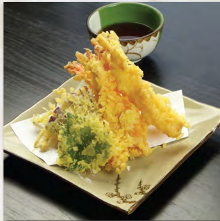
天ぷら盛 り合わせ Tempura Moriawase $22.80 Assorted Deep Fried Items with Light Batter