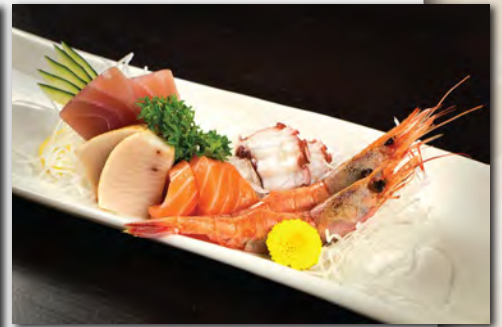
刺身 竹 Sashimi Take $28.80 Assorted Sliced Raw Fish and Seafood