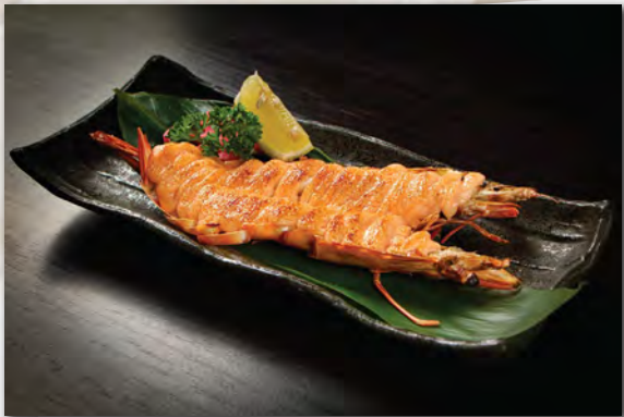
車海老の明太マヨ焼き Kurumaebi no Mentai Mayoyaki $15.80 Grilled Tiger Prawn with Pollock Roe Mayonnaise