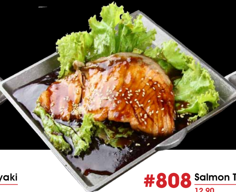
#808 Salmon Teriyaki 12.90