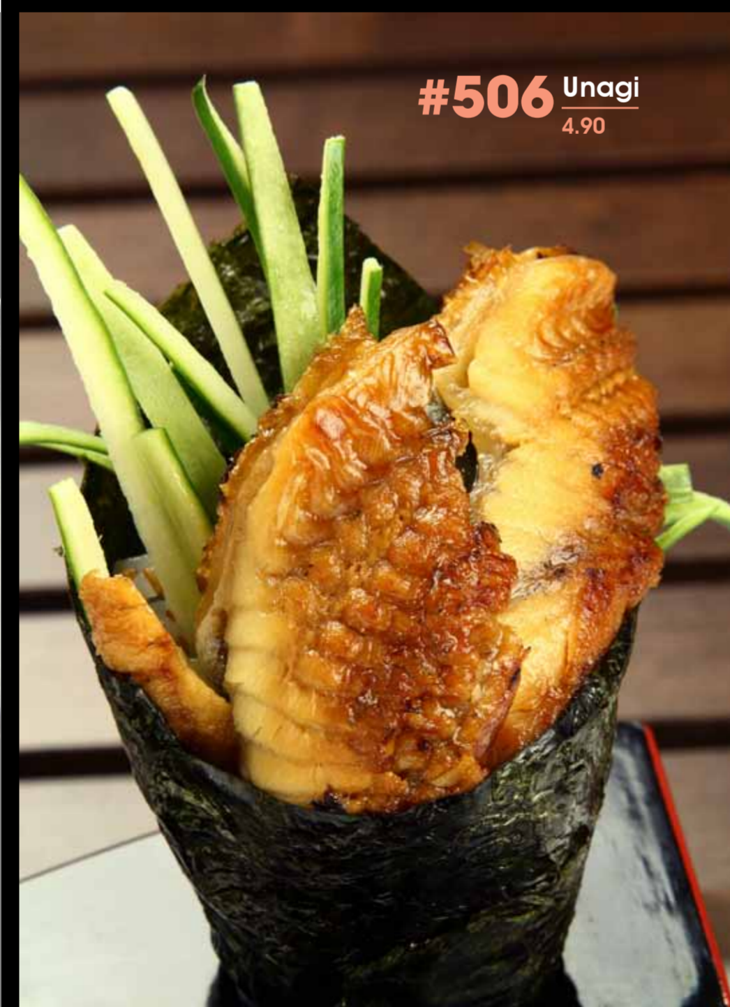
#506 Unagi 4.90