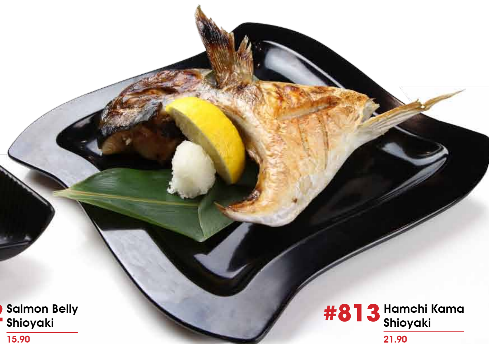
#813 Hamchi Kama Shioyaki 21.90