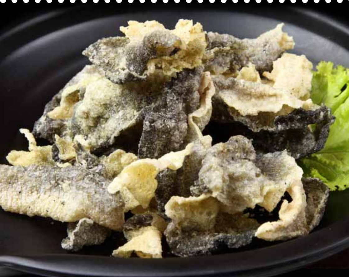
#202 Salmon Skin 3.90