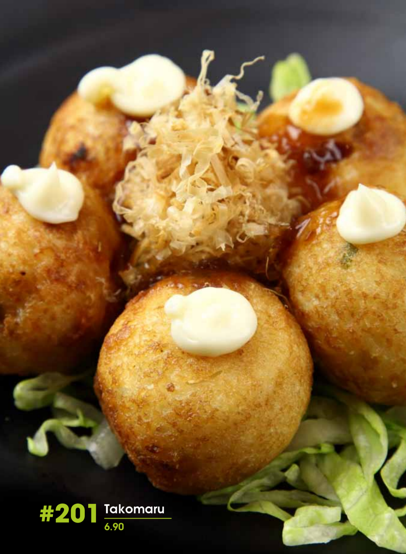
#201 Takomaru 6.90