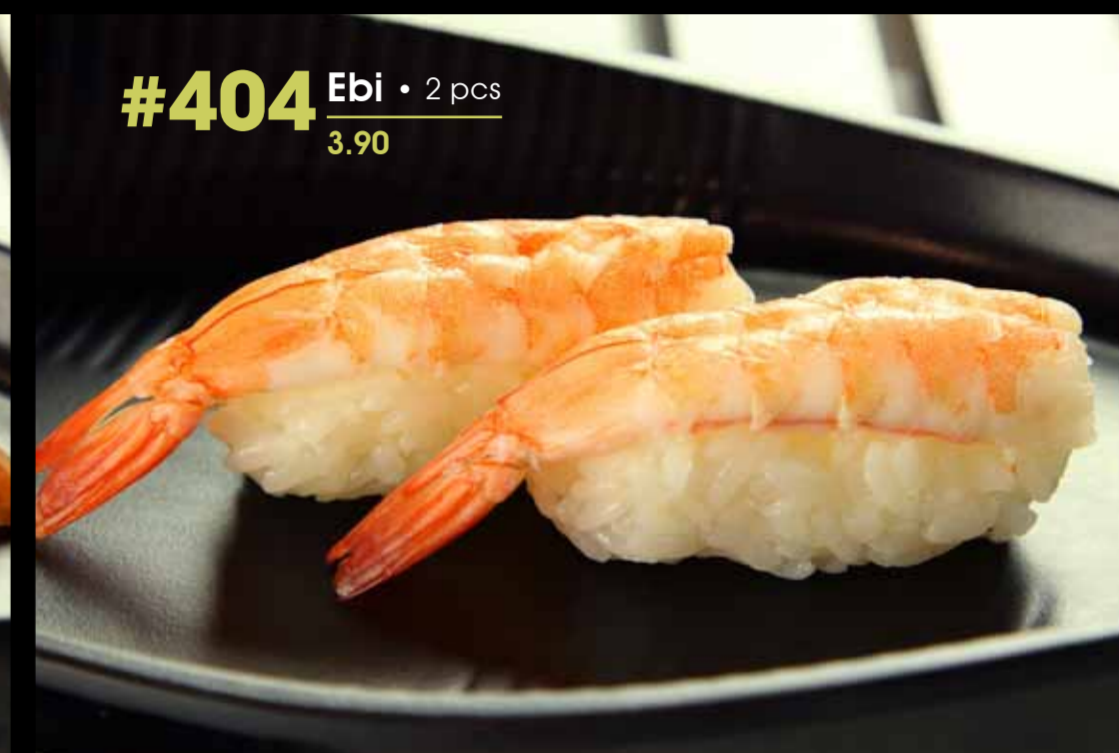
#404 Ebi • 2 pcs 3.90