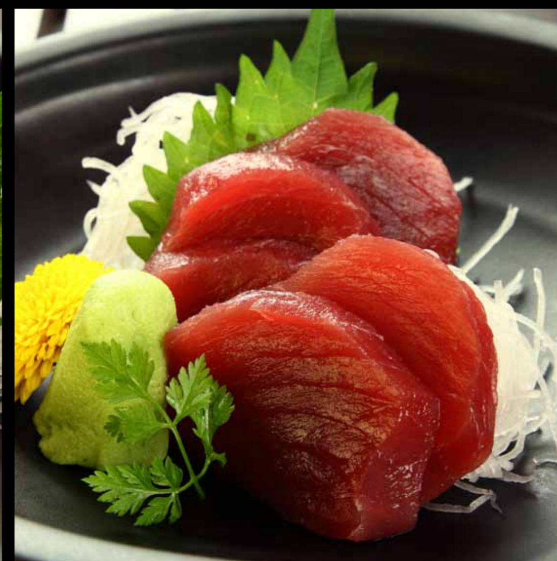
#302 Maguro • 5 pcs 8.90