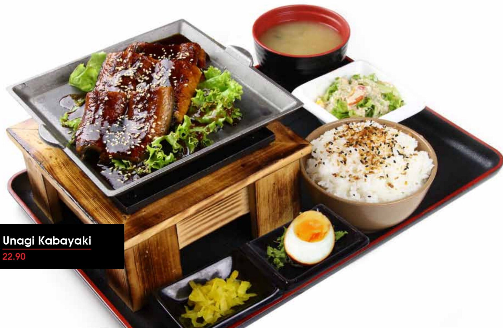
#705 Unagi Kabayaki 22.90