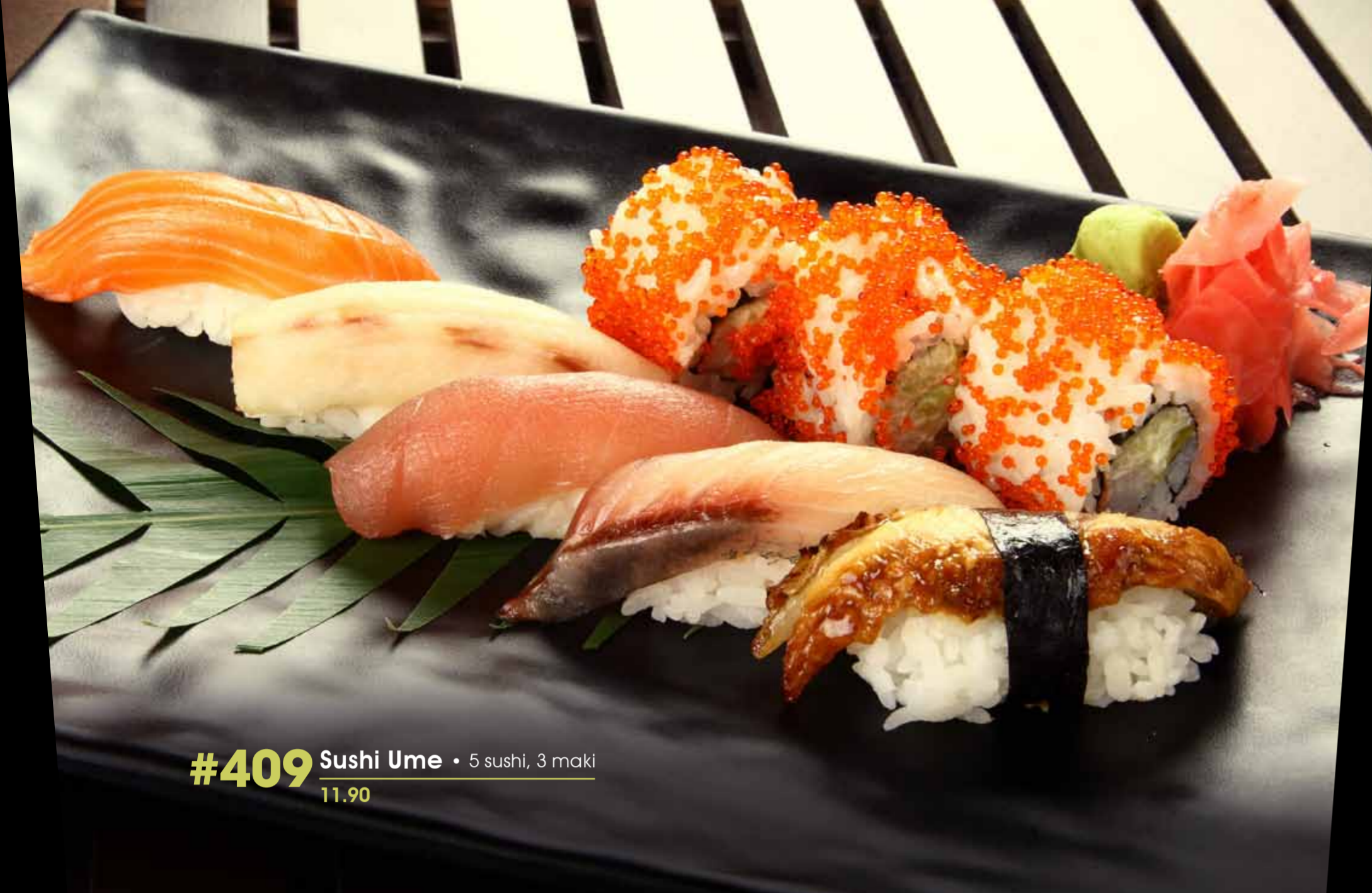
#409 Sushi Ume • 5 sushi, 3 maki 11.90