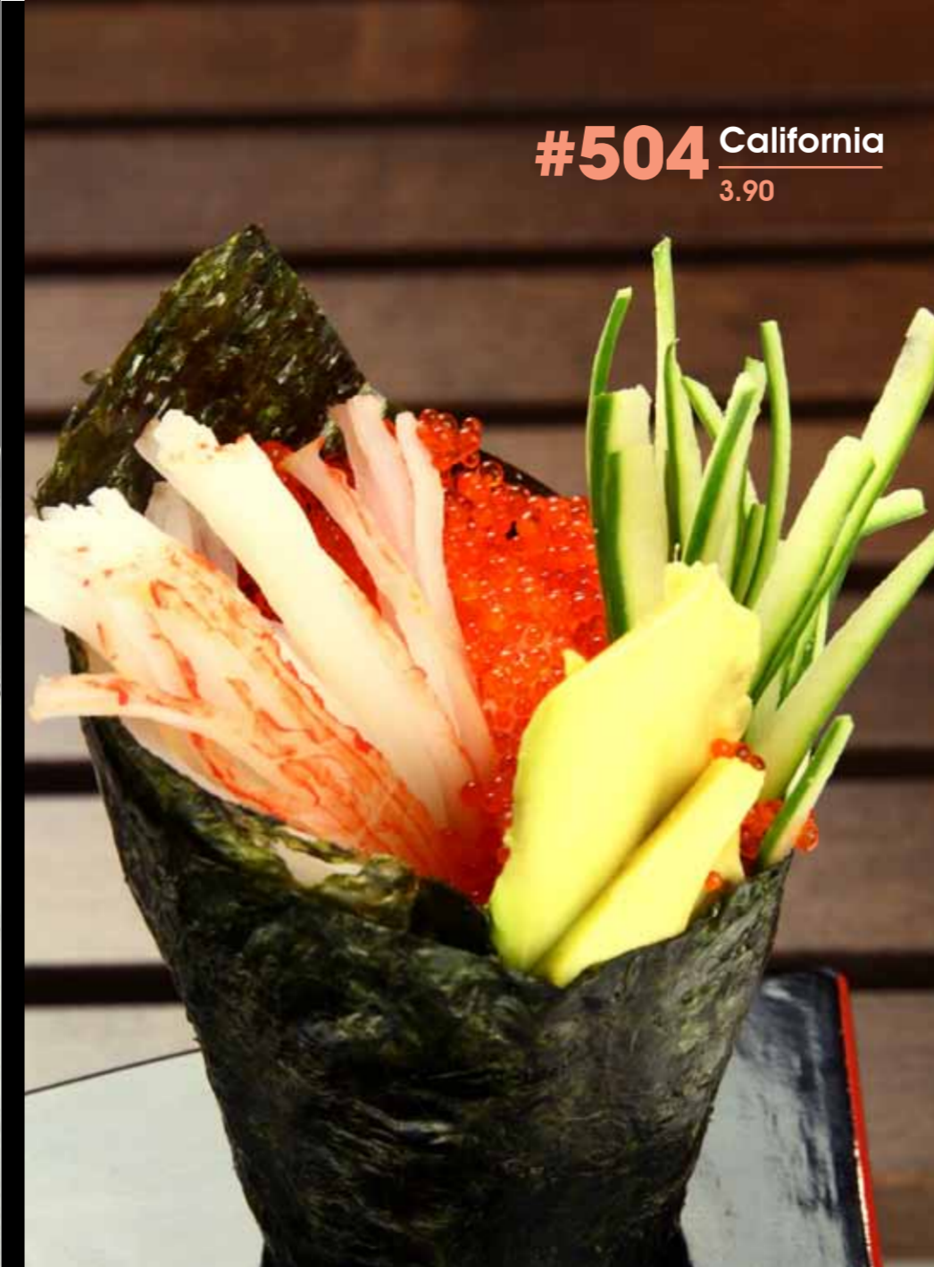
#504 California 3.90