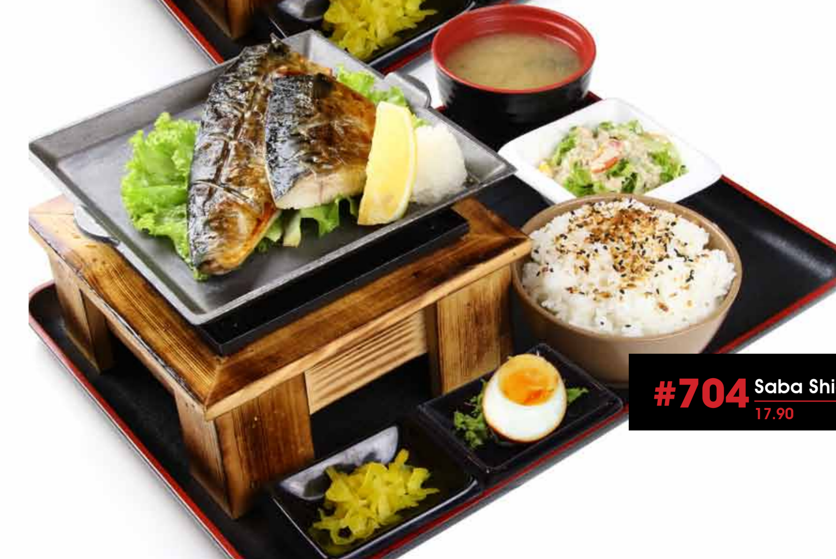
#704 Saba Shio Yaki 17.90