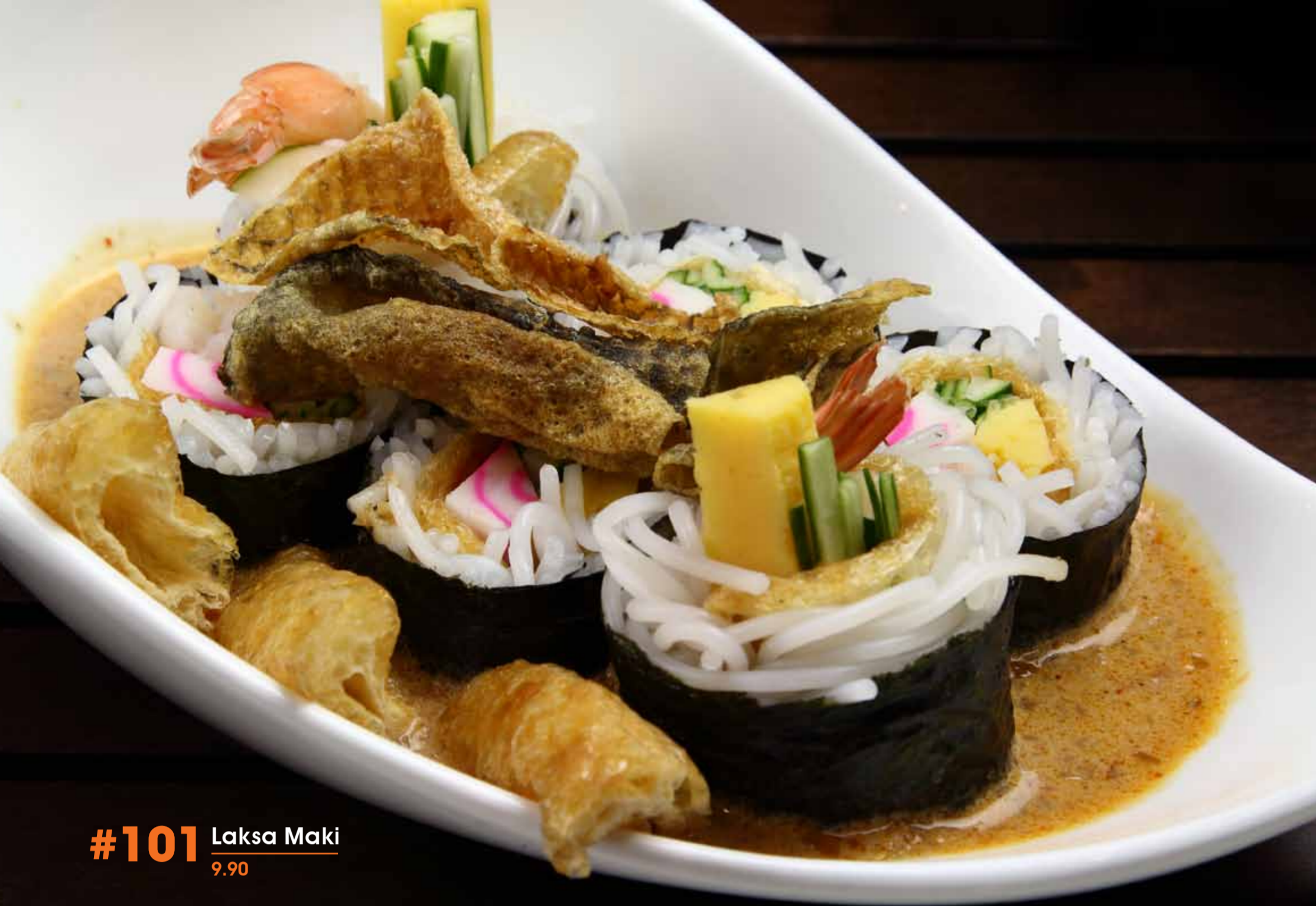
#101 Laksa Maki 9.90