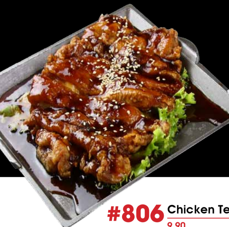
#806 Chicken Teriyaki 9.90