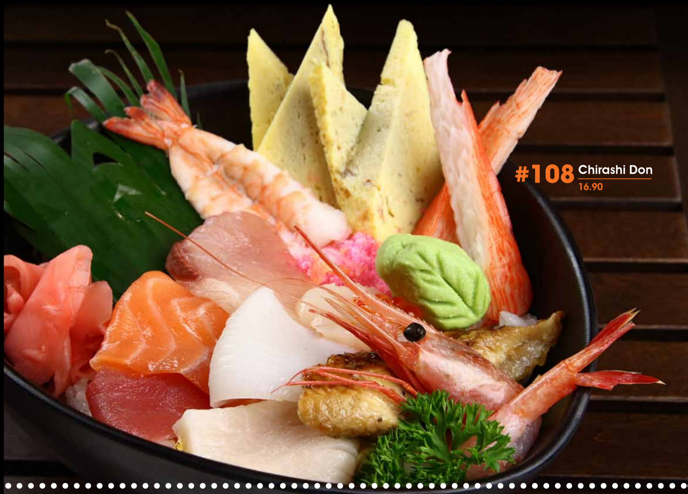
#108 Chirashi Don 16.90