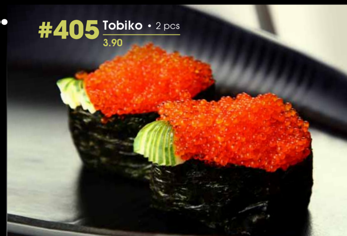
#405 Tobiko • 2 pcs 3.90