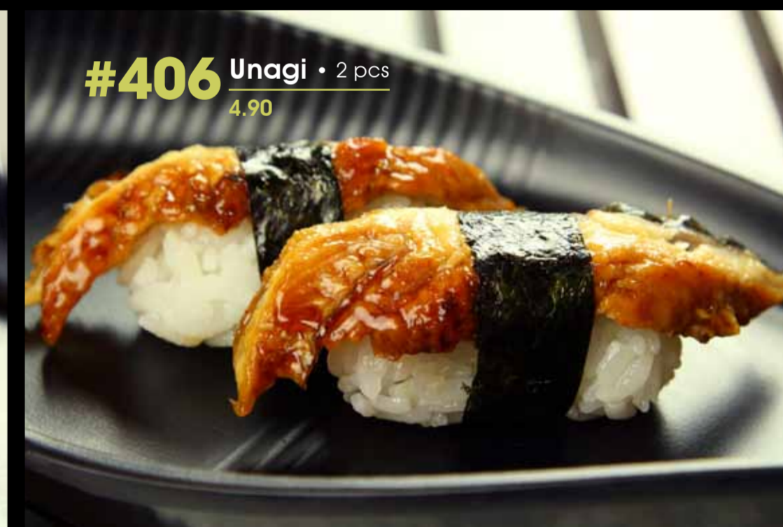
#406 Unagi • 2 pcs 4.90