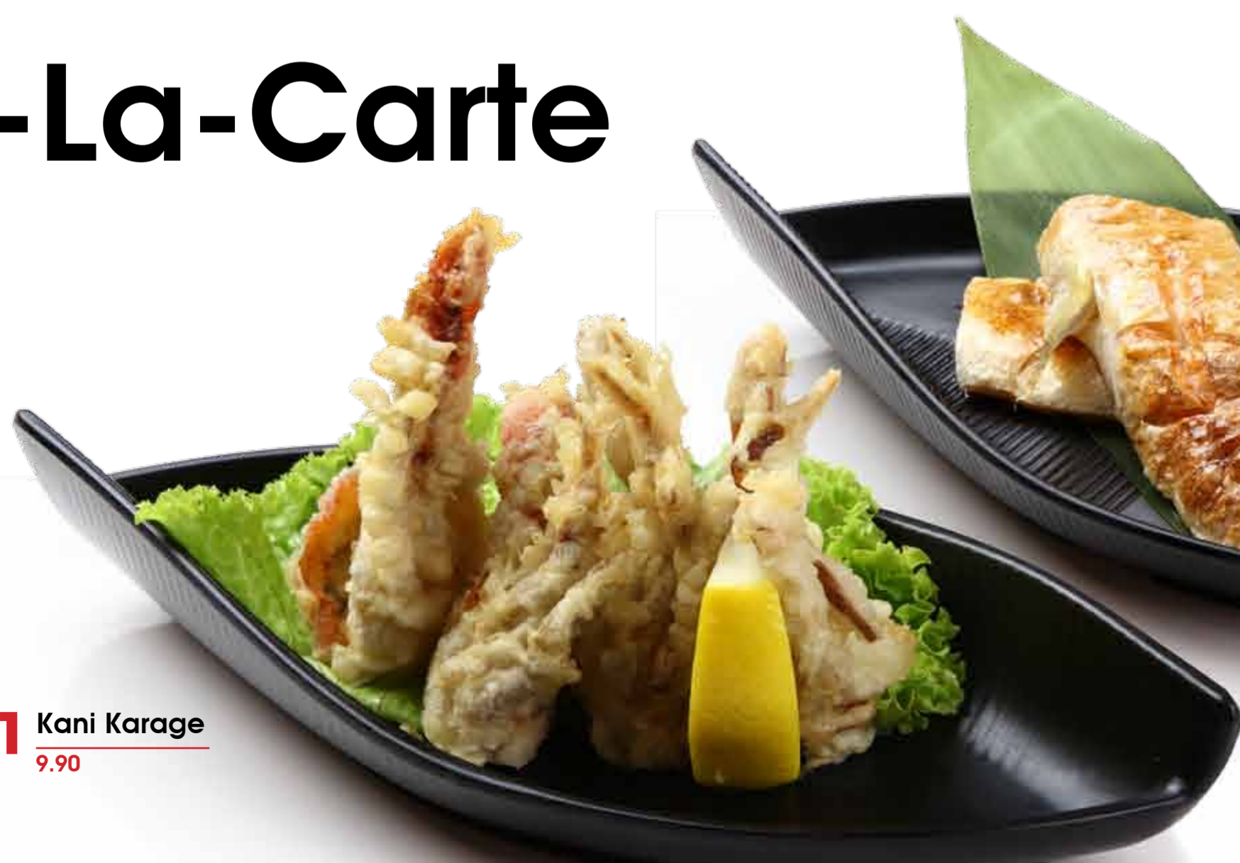
#811 Kani Karage 9.90