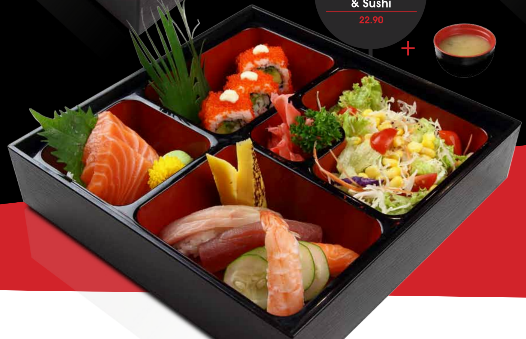
#604 Sashimi & Sushi 22.90