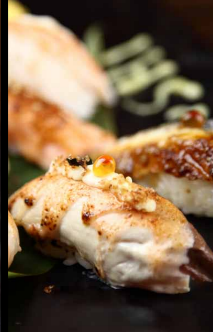
#106 Sushi Aburi • 7 pcs 13.90