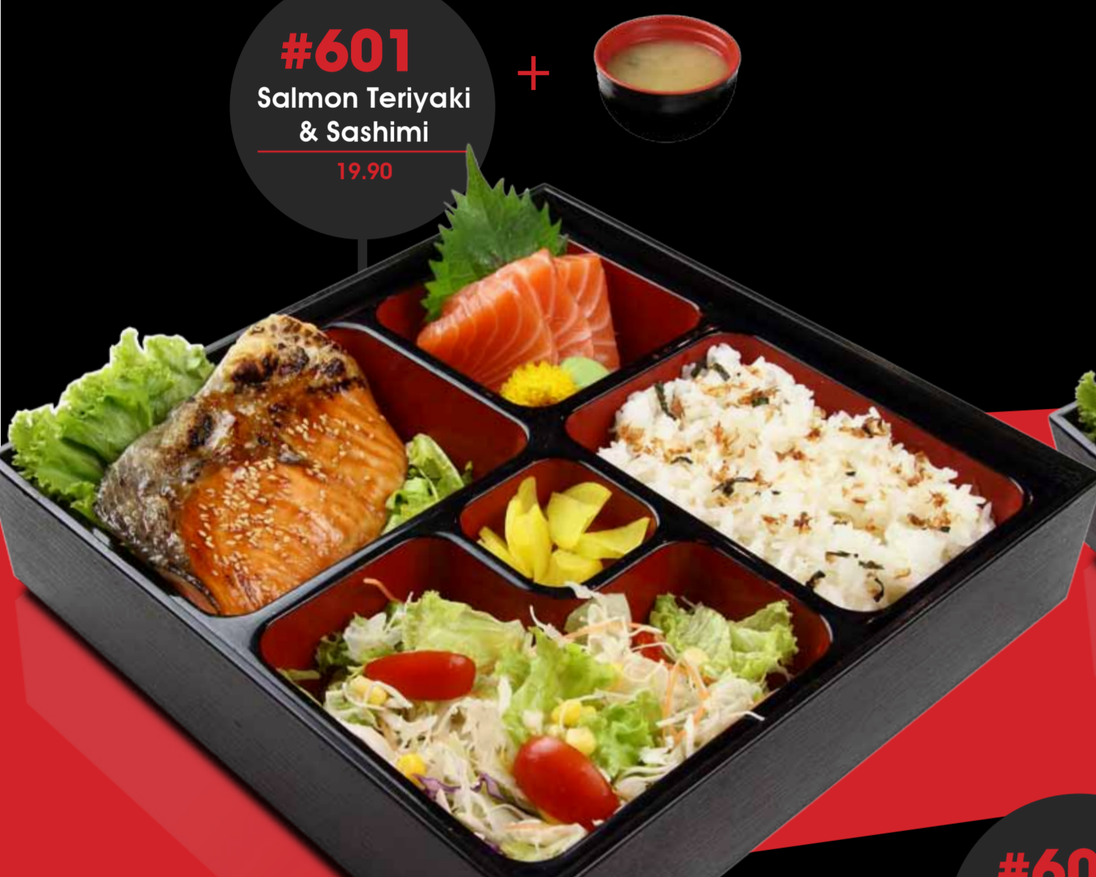
#601 Salmon Teriyaki & Sashimi 19.90