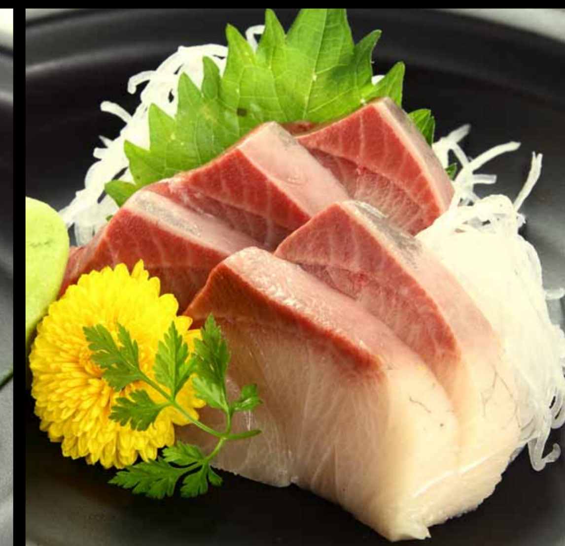
#304 Hamachi • 5 pcs 12.90