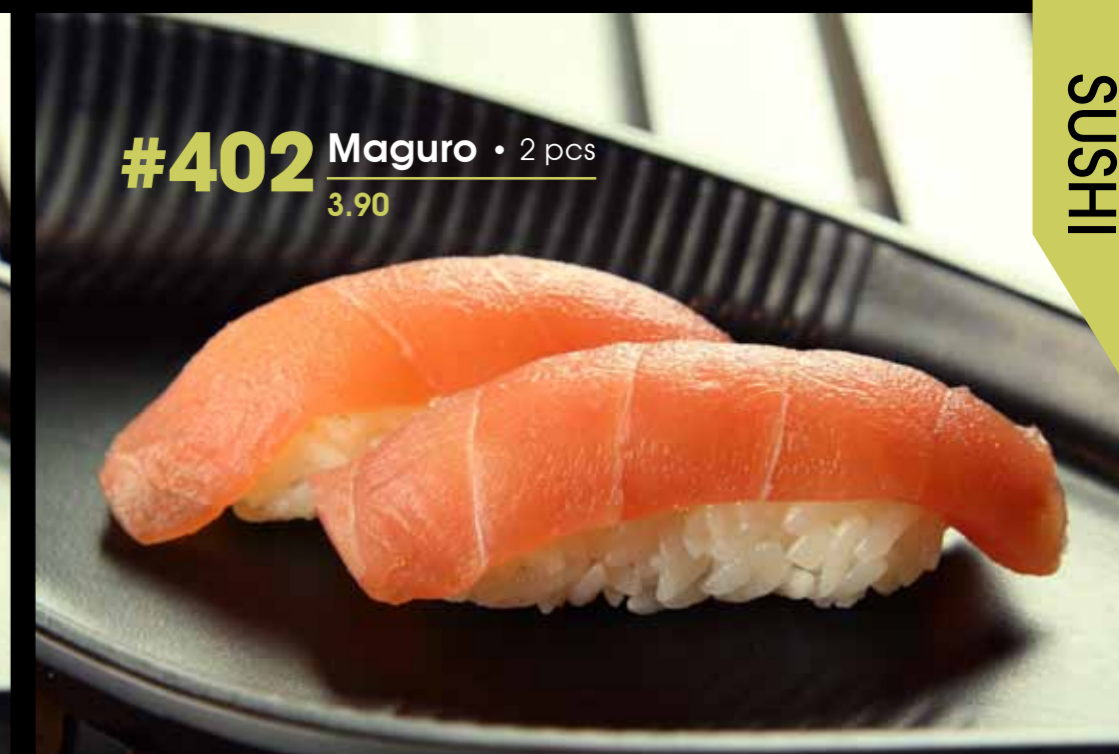
#402 Maguro • 2 pcs 3.90