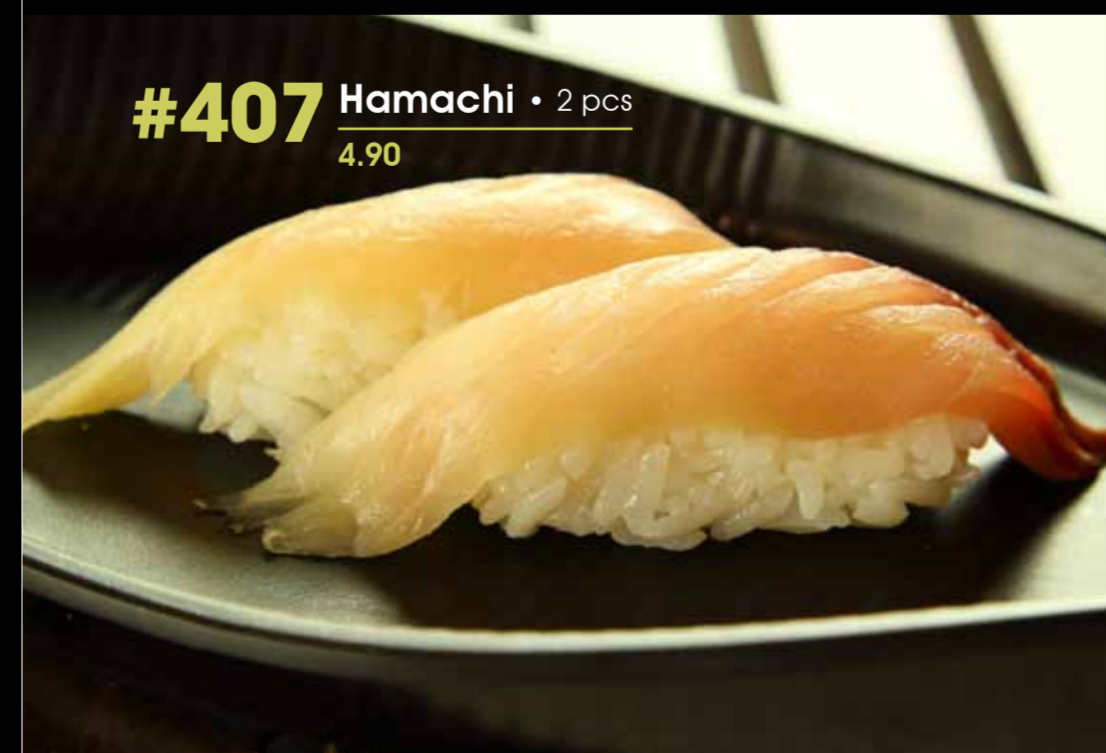
#407 Hamachi • 2 pcs 4.90