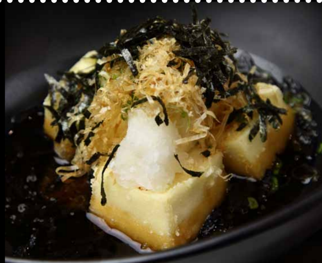
#203 Agedashi Tofu 6.90