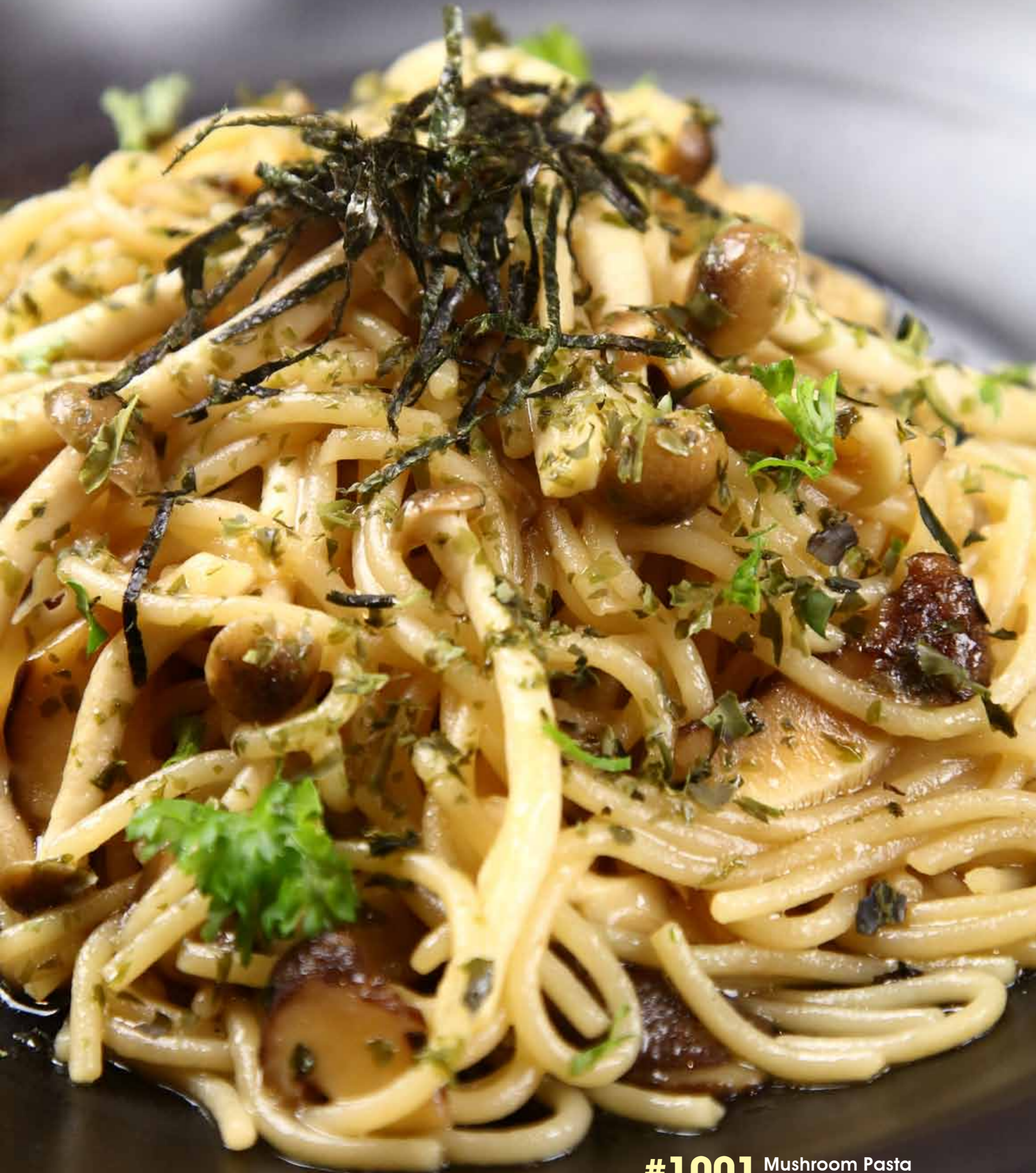
#1001 Mushroom Pasta 12.90