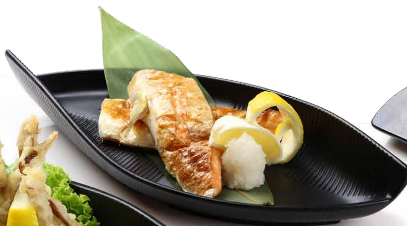
#812 Salmon Belly Shioyaki 15.90