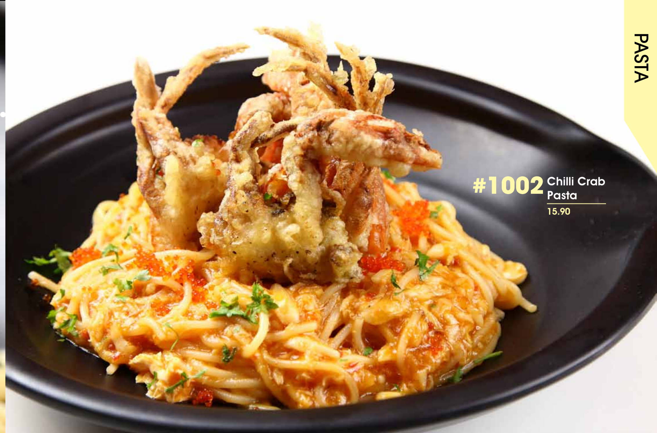
#1002 Chilli Crab Pasta 15.90