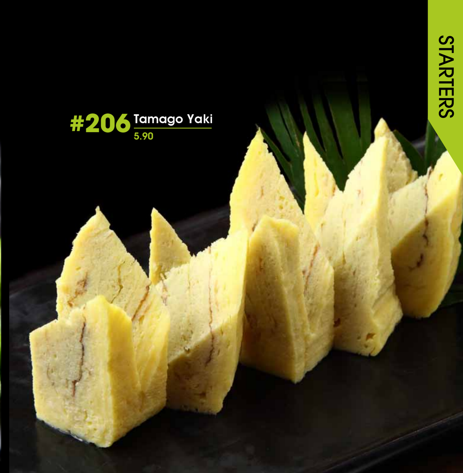
#206 Tamago Yaki 5.90