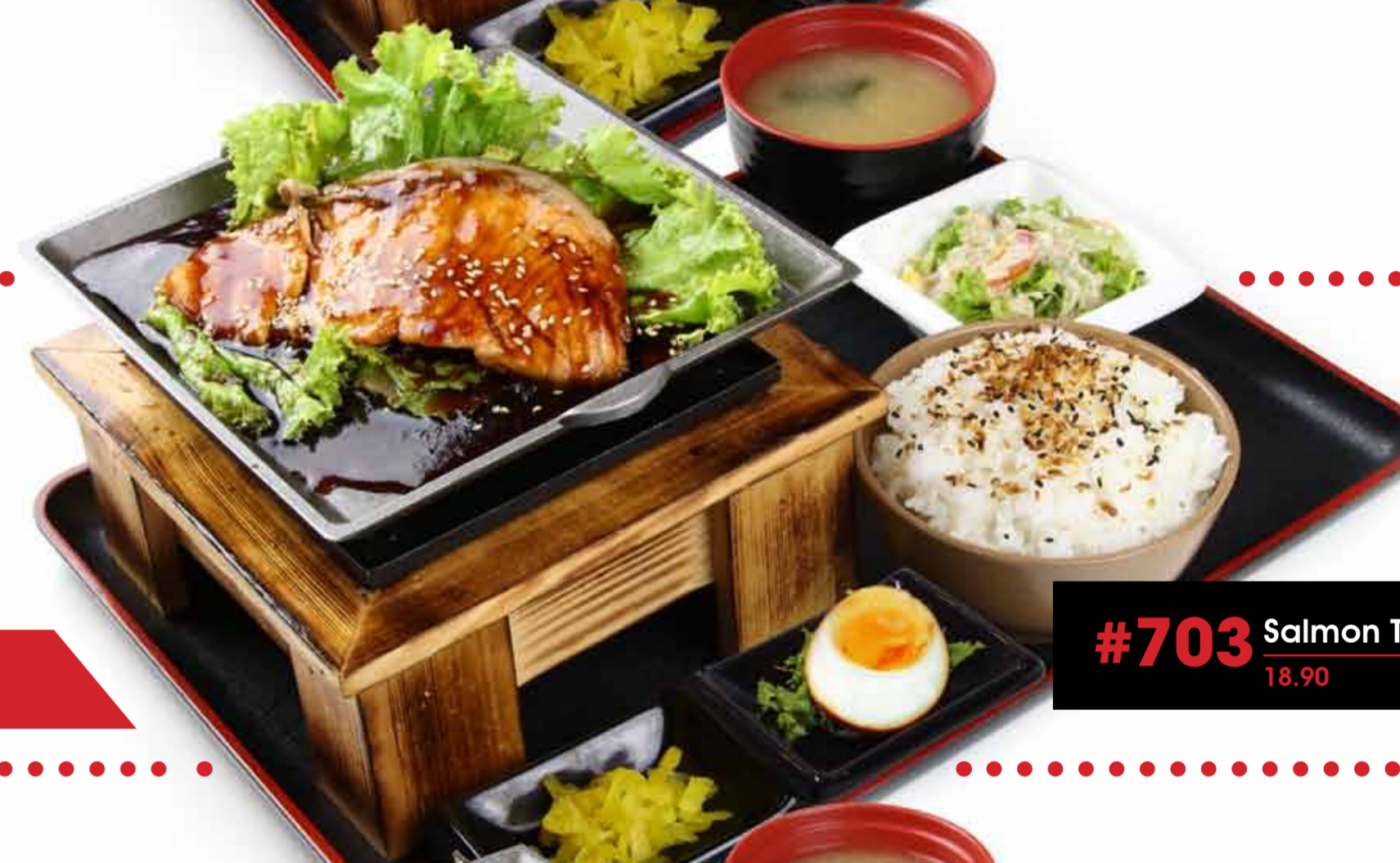
#703 Salmon Teriyaki 18.90