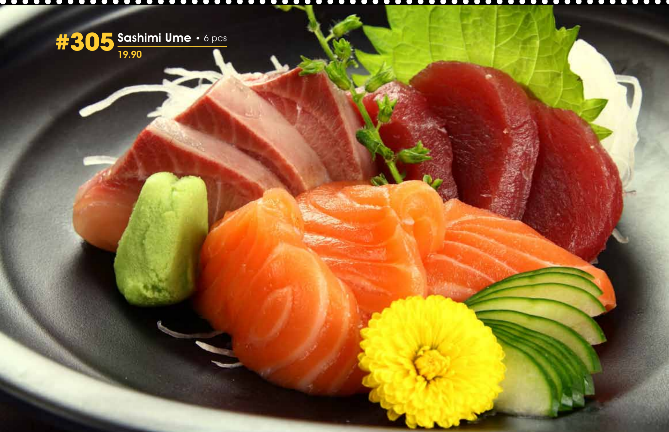
#305 Sashimi Ume • 6 pcs 19.90