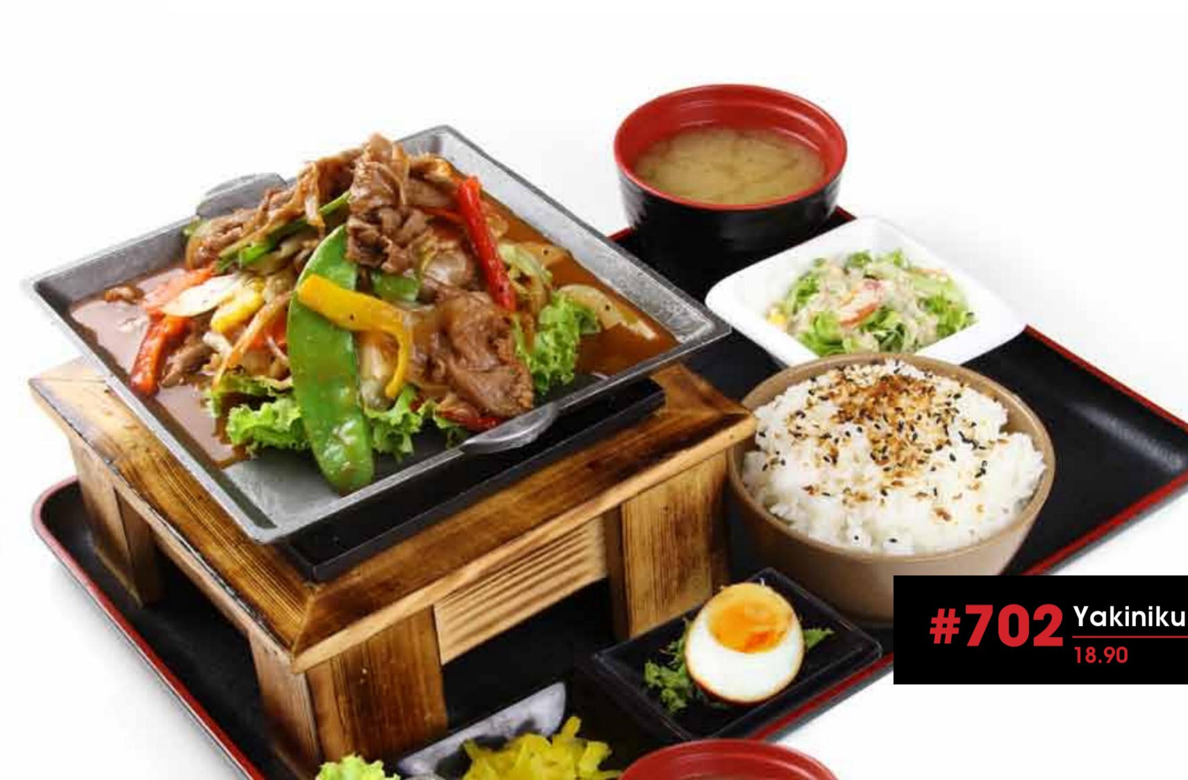
#702 Yakiniku 18.90