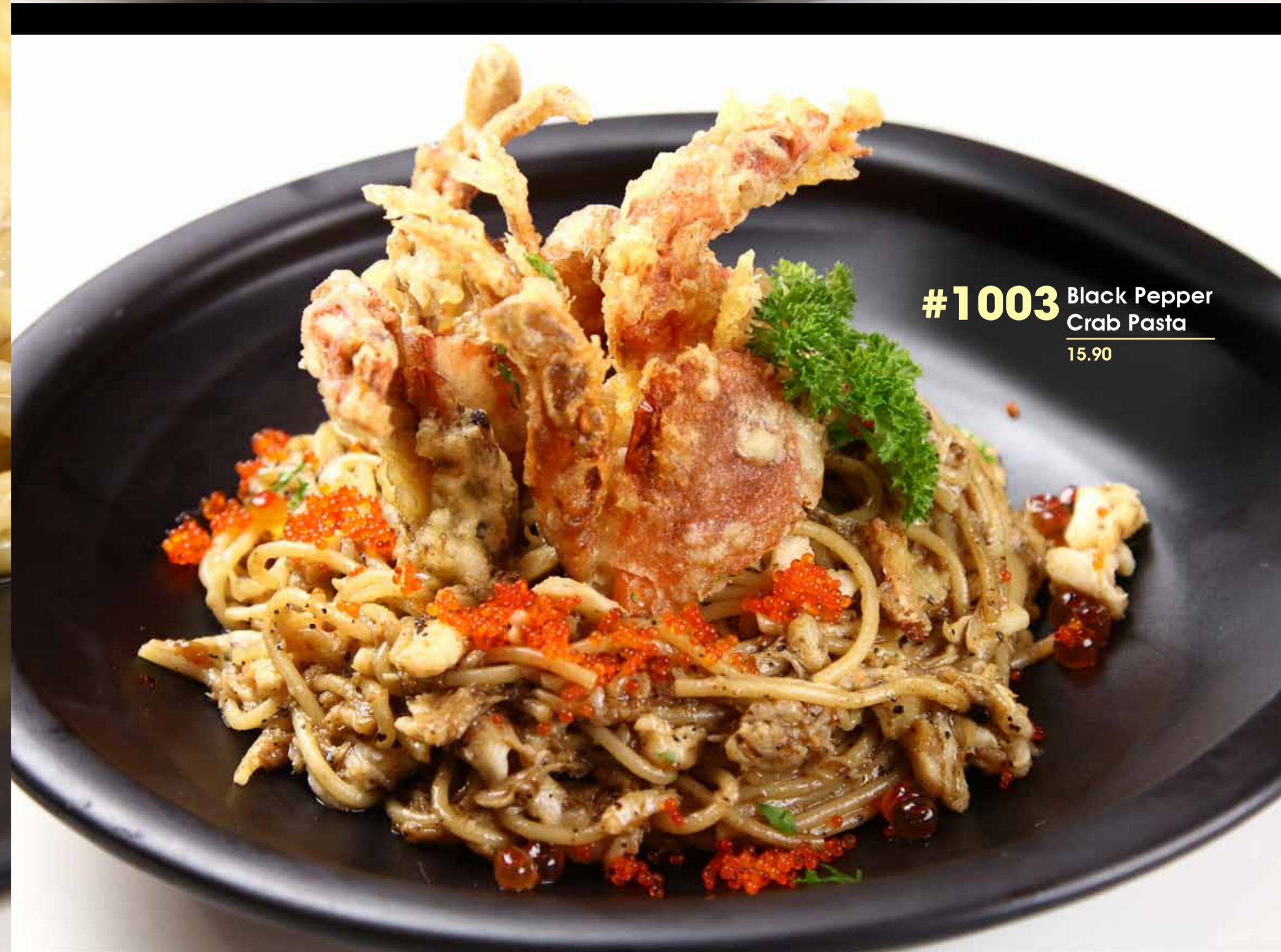
#1003 Black Pepper Crab Pasta 15.90