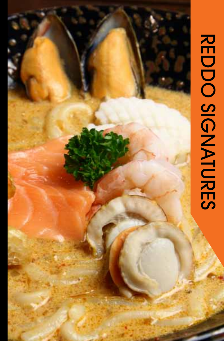
#107 Kaisen Udon 13.90