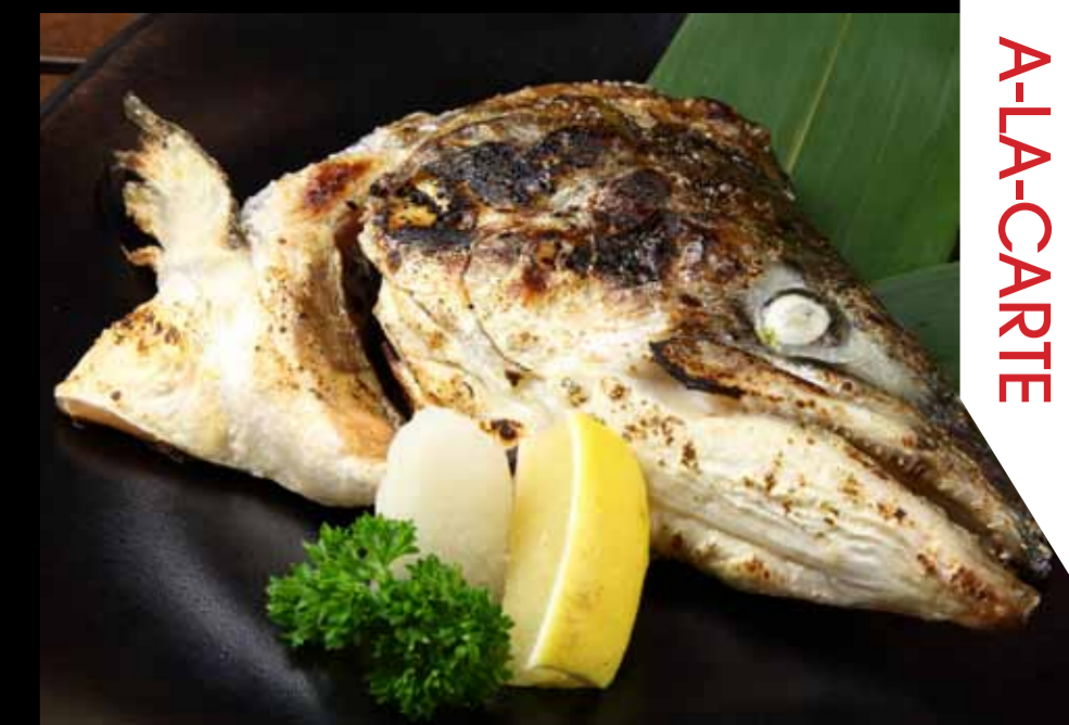
#805 Salmon Atame Shio 12.90