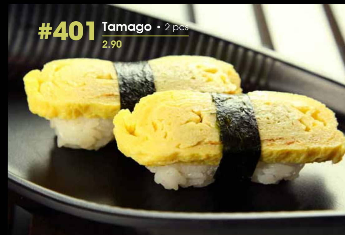
#401 Tamago • 2 pcs 2.90