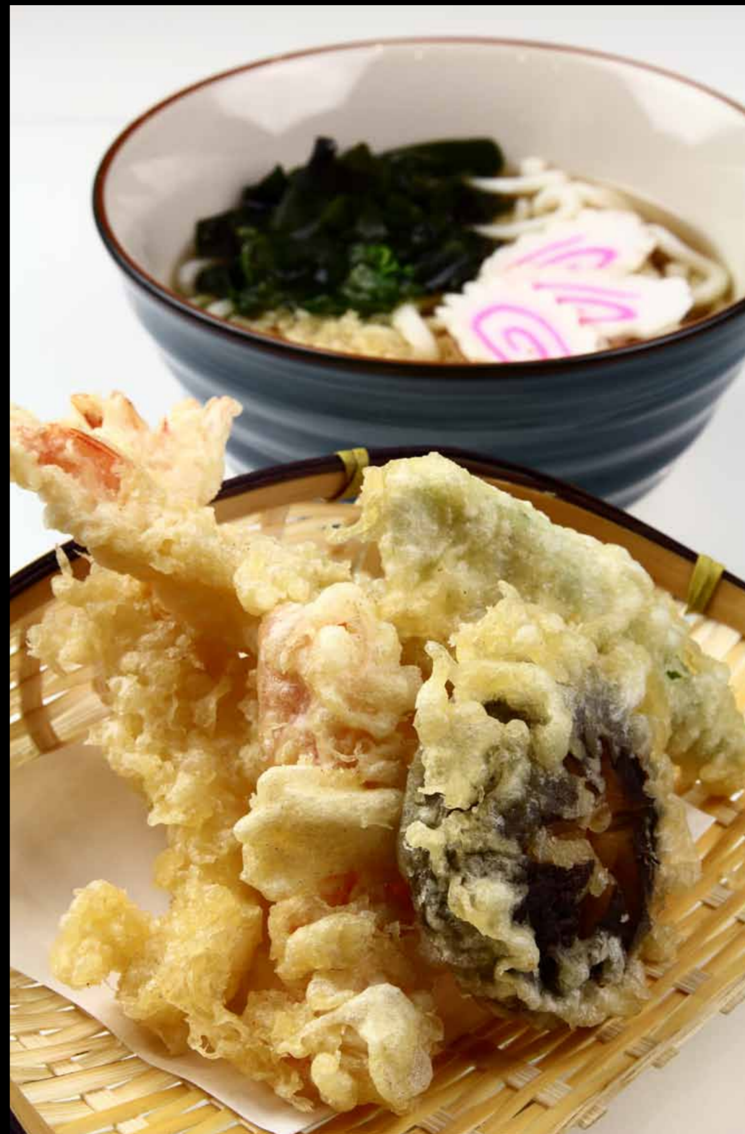
#902 Tempura Udon 13.90