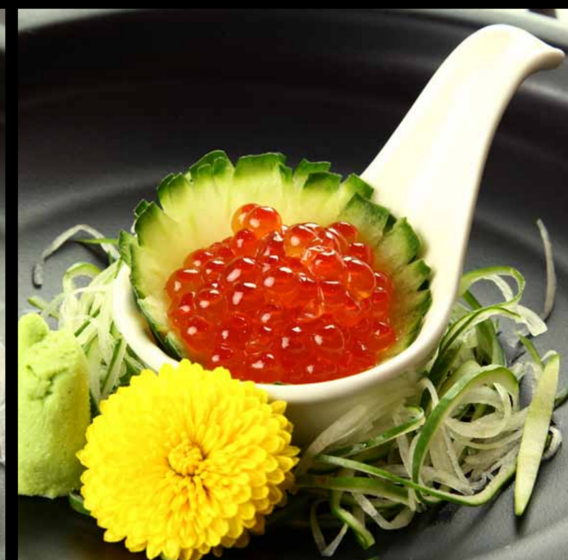
#303 Ikura 12.90