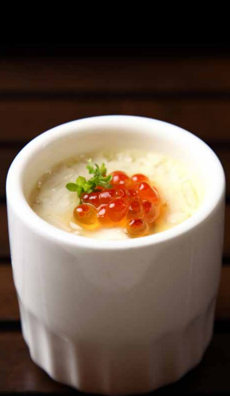
#204 Chawan Mushi 3.90