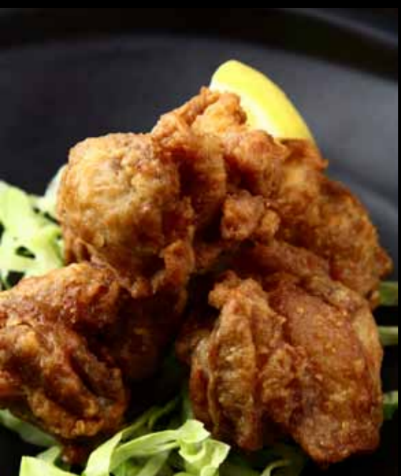
#801 Tori Karage 7.90