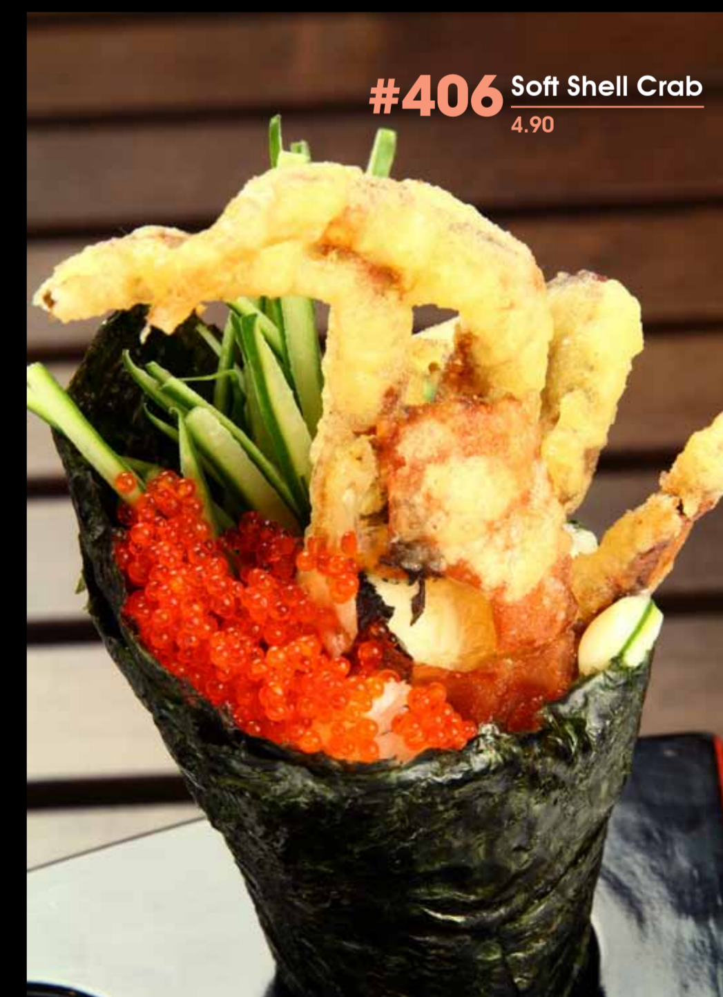
#406 Soft Shell Crab 4.90