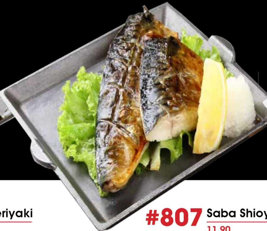
#807 Saba Shioyaki 11.90