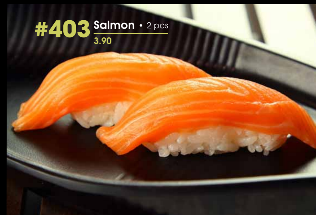
#403 Salmon • 2 pcs 3.90