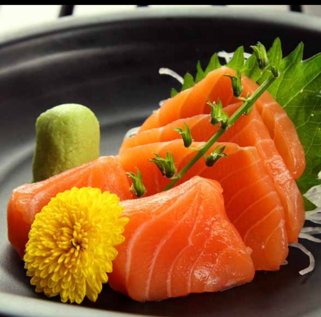
#301 Salmon • 5 pcs 7.90