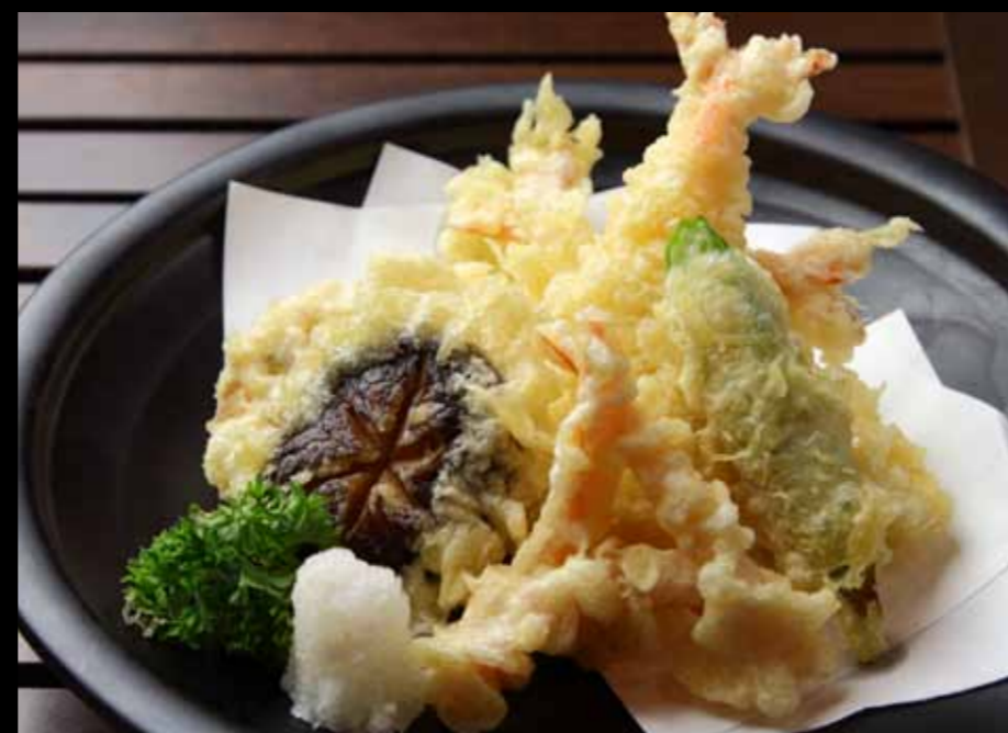
#803 Tempura Moriawase 9.90