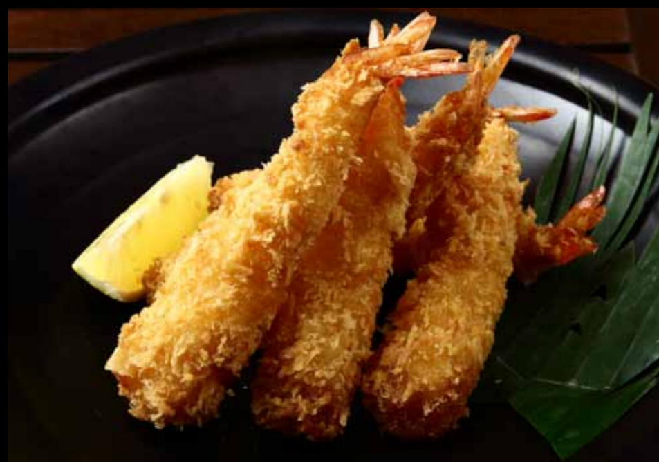
#802 Ebi Furai 8.90