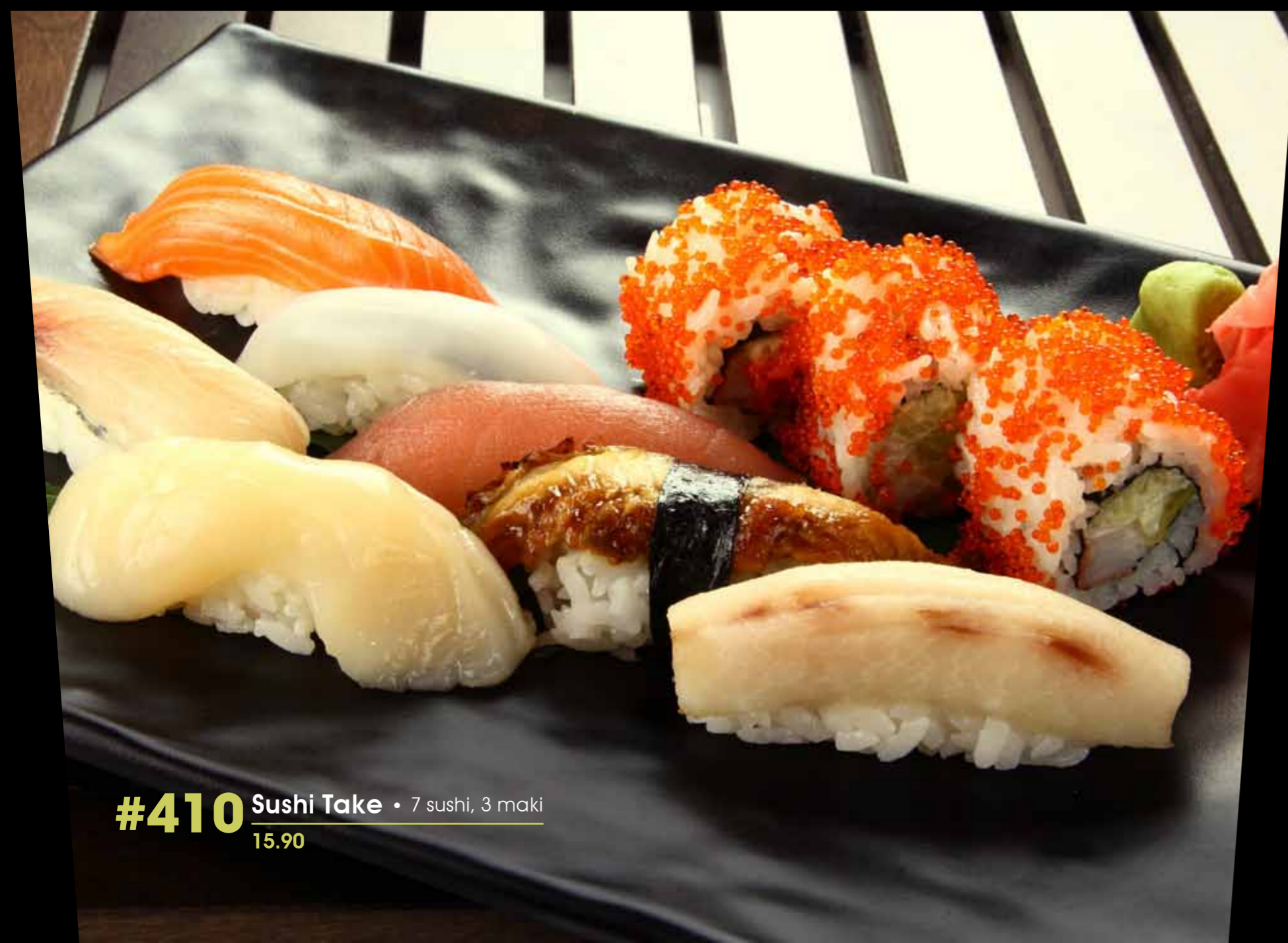
#410 Sushi Take • 7 sushi, 3 maki 15.90