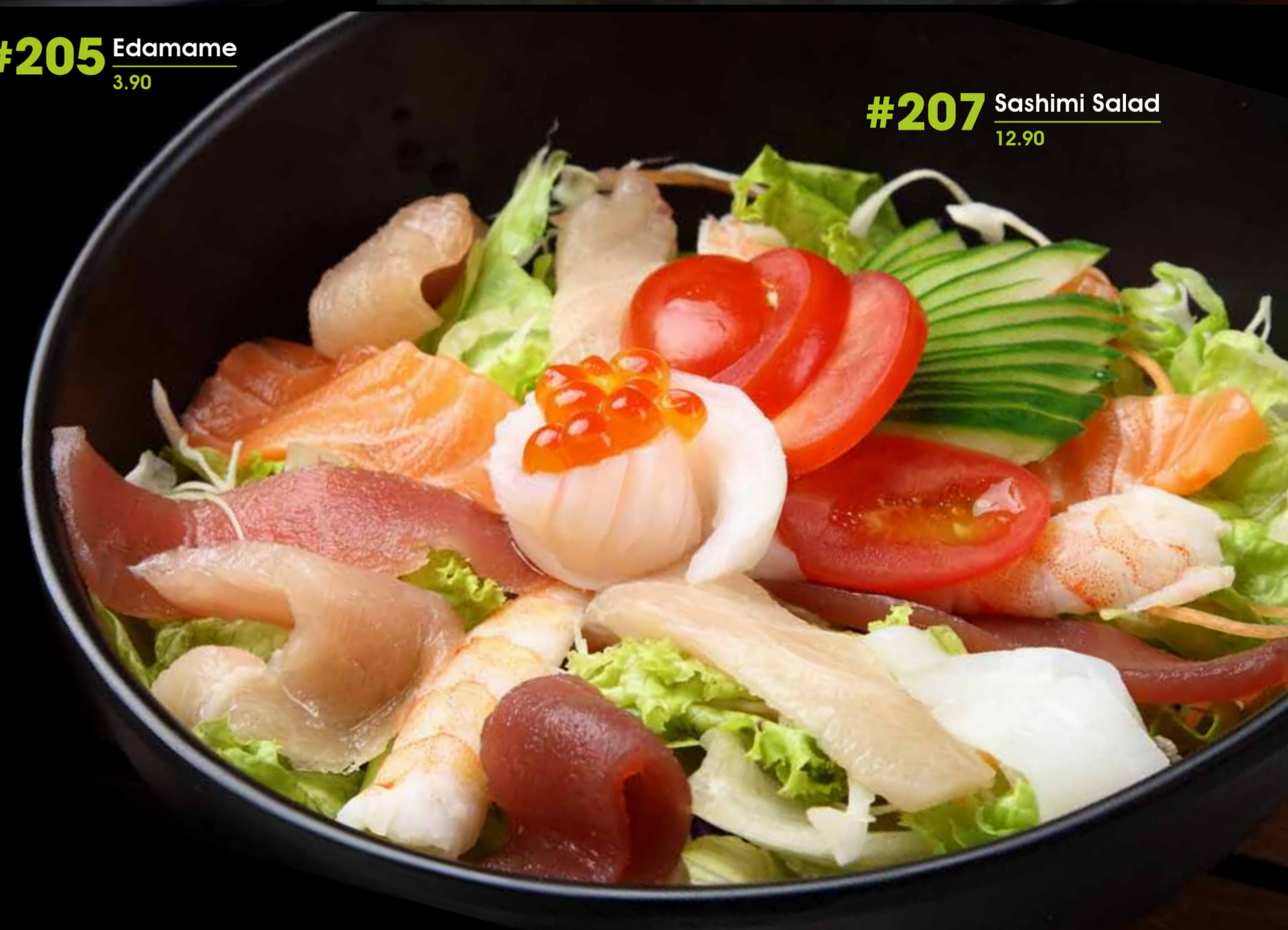
#207 Sashimi Salad 12.90