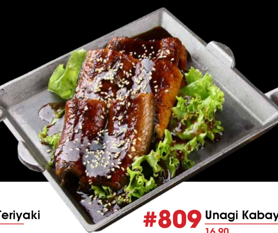
#809 Unagi Kabayaki 16.90