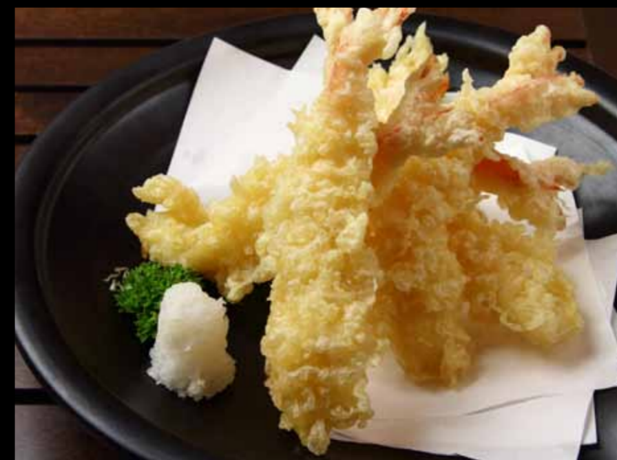
#804 Ebi Tempura 10.90