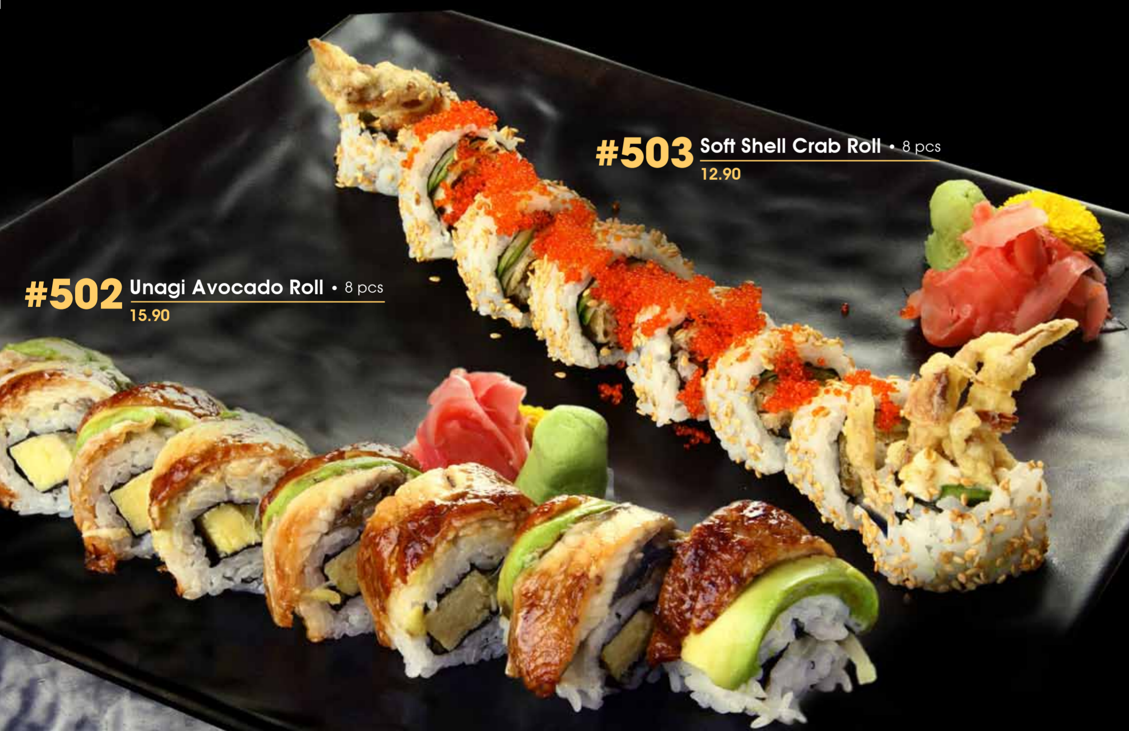
#503 Soft Shell Crab Roll • 8 pcs 12.90