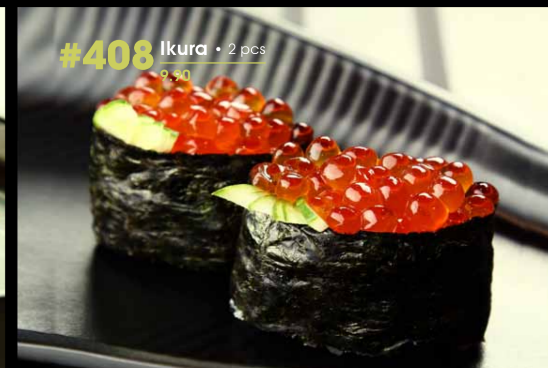
#408 Ikura • 2 pcs 8.90