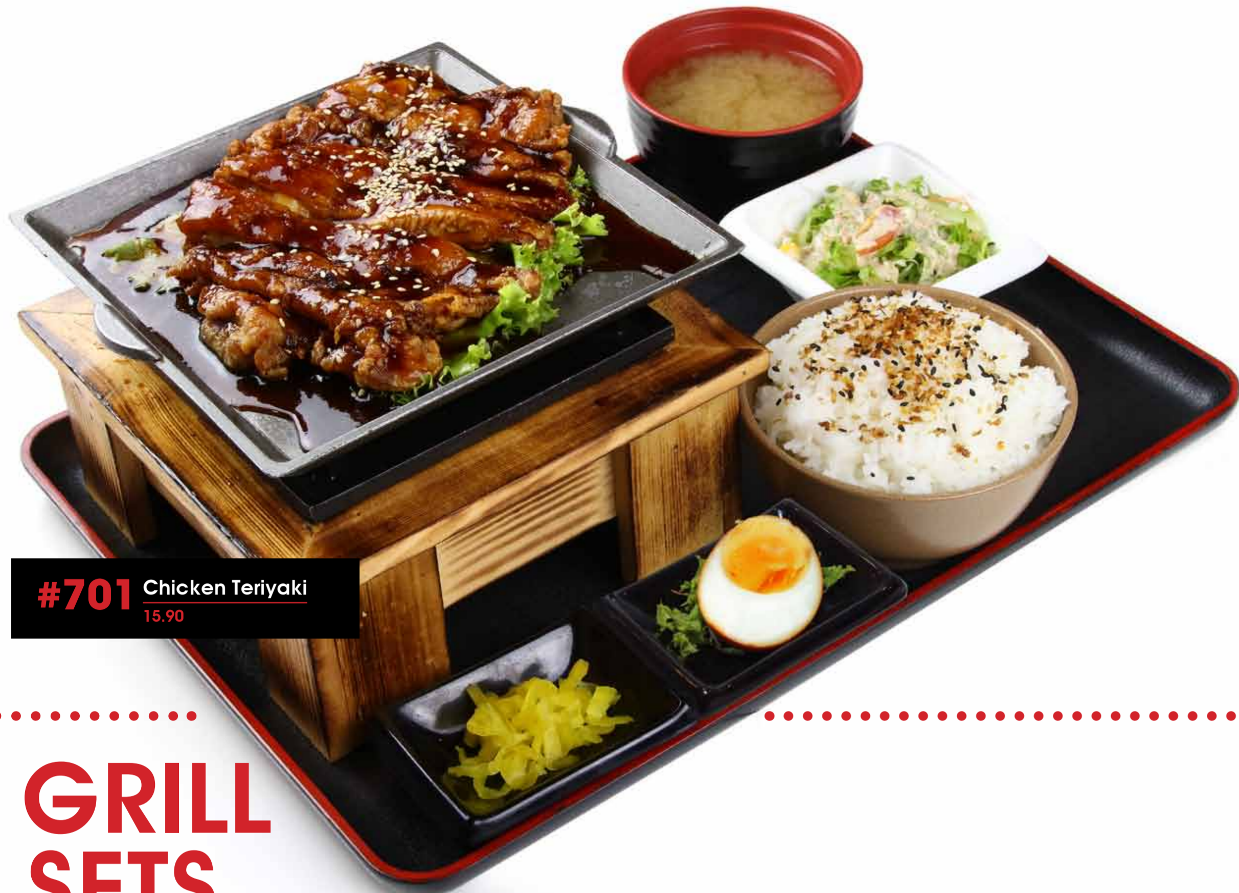
#701 Chicken Teriyaki 15.90