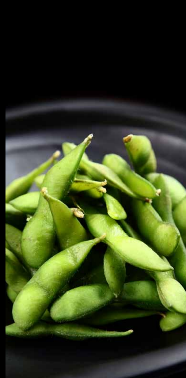
#205 Edamame 3.90