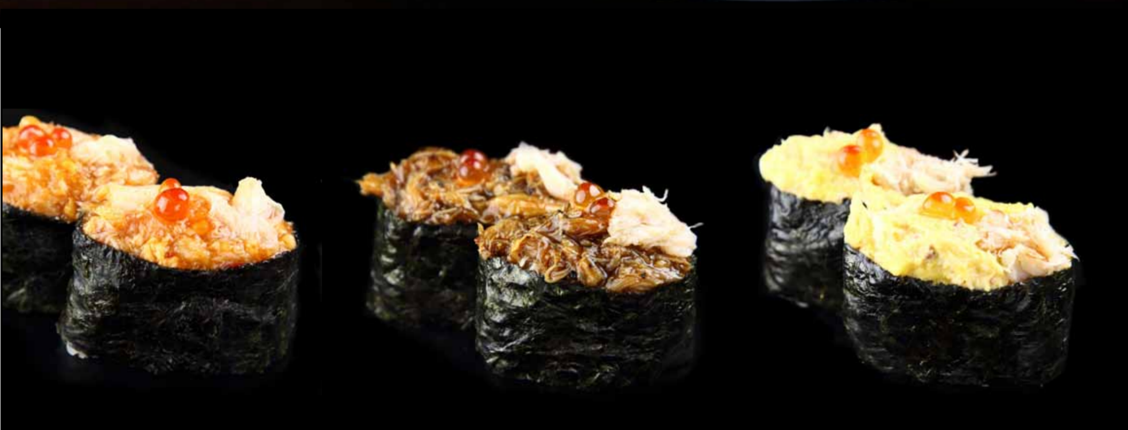
#102 Chilli Crab Sushi 5.90