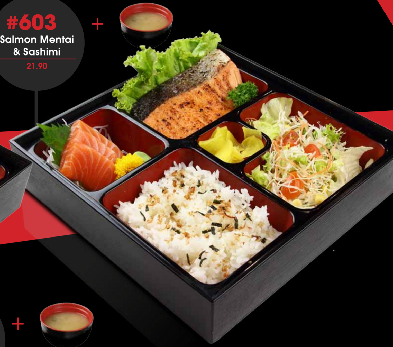
#603 Salmon Mentai & Sashimi 21.90