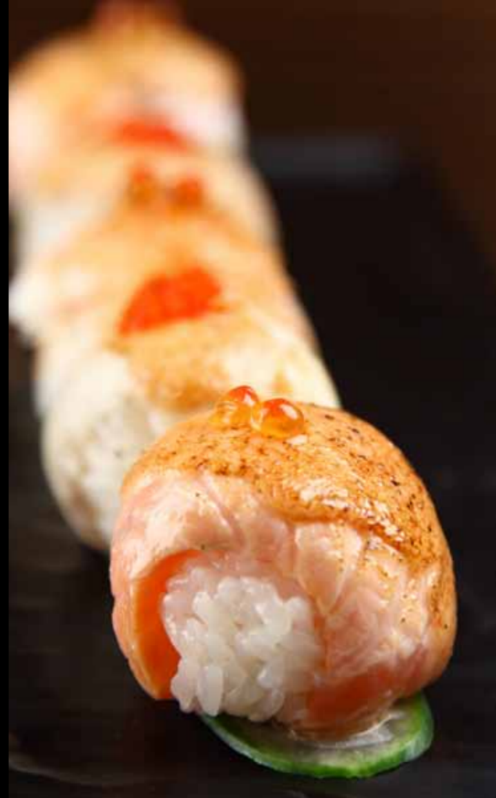
#105 Tamali Sushi • 5 pcs 12.90