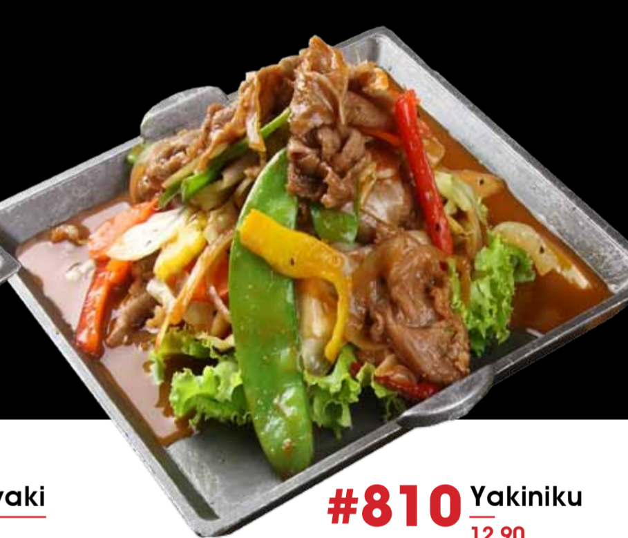
#810 Yakiniku 12.90