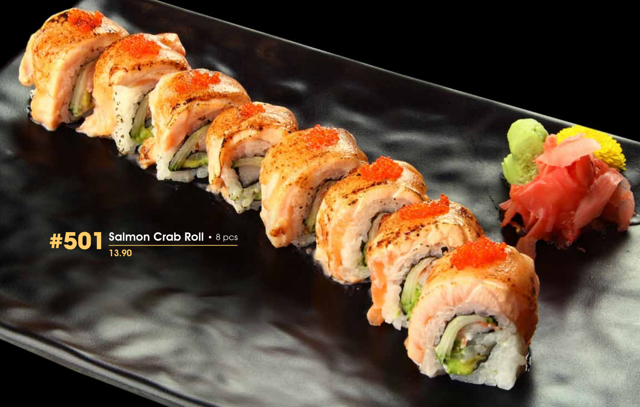
#501 Salmon Crab Roll • 8 pcs 13.90